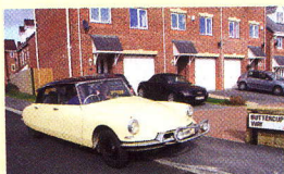
Made for each other