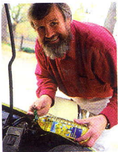
Dircks takes brand loyalty to a new level