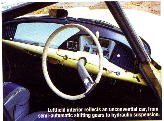
Leftfield interior reflects an unconventional car, from semi-automatic shifting gears to hydraulic suspension

Once it was up (literally) and running again, the DS was a highlight of the four-day 50th celebrations in Paris, which included a parade by 1600 DSs from the Arc de Triomphe to the Eiffel Tower. 'Loads of people wanted photos of me and the car with the Aussie flag.' And his 'roo bar was a real talking point. It was originally offered as an accessory for the Australian market, but Dircks fabricated his own after