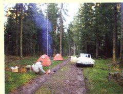
I'm sure this isn't a golf course