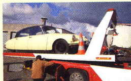
Strange tow truck device and DS