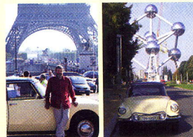
DS returns to its homeland

Buttercup stars in a parade of 1600 other DS cars through the heart of Paris, 50 years after the model was launched. 'Everyone wants a photo of me with Buttercup!'